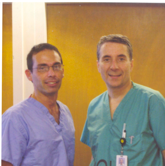
American College of Surgeons, 2009 Clinical Congress, Chicago IL