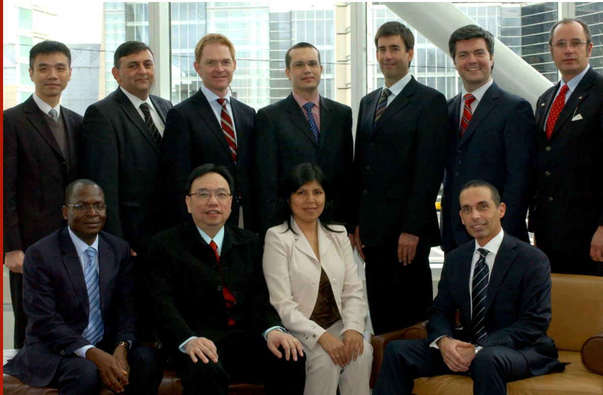
2009 American College of Surgeons International Guest Scholars