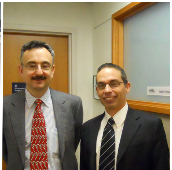
Massachusetts General Hospital, Harvard Medical School, Boston MA